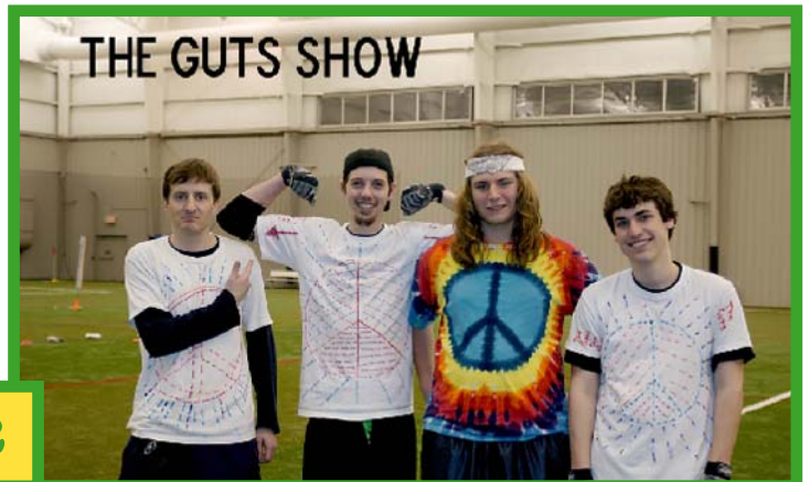
THE GUTS SHOW