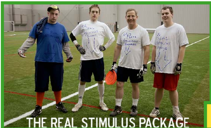
THE REAL STIMULUS PACKAGE